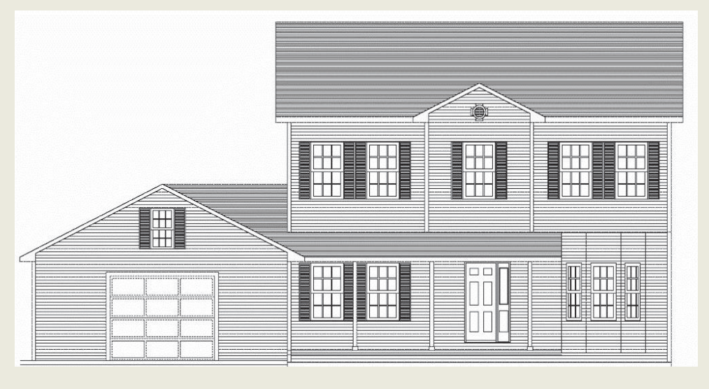
Figure 1. Traditional style elevation blueprint drawing

There are two types of blueprint drawings that are used in the construction industry that correlate to the theoretical framework of the dissertation. First, an architect must create an elevation drawing to display the exterior of the home. This drawing offers an outside view of the style and structure, as shown in Figure 1.