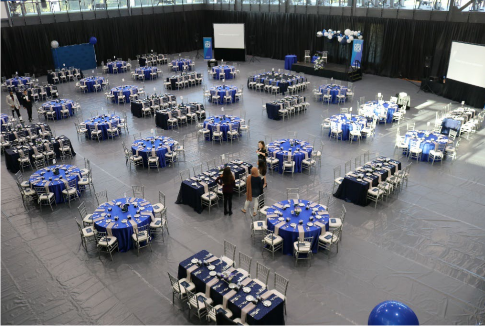
Figure 3: UHCL Alumni Donor Gala