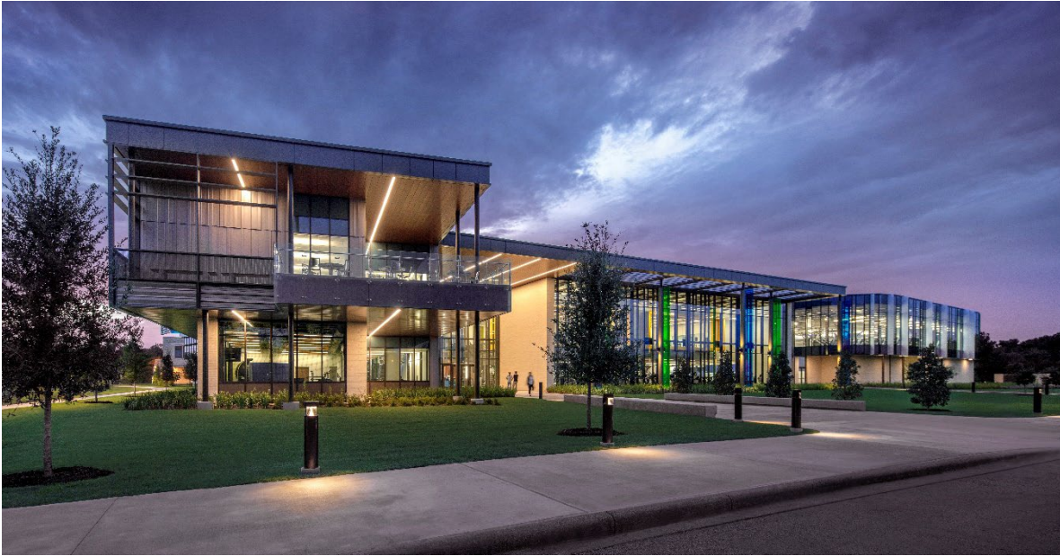
Recreation and Wellness Center

UHCL Recreation and Wellness Center (photograph by Bill Timmerman, 2018)