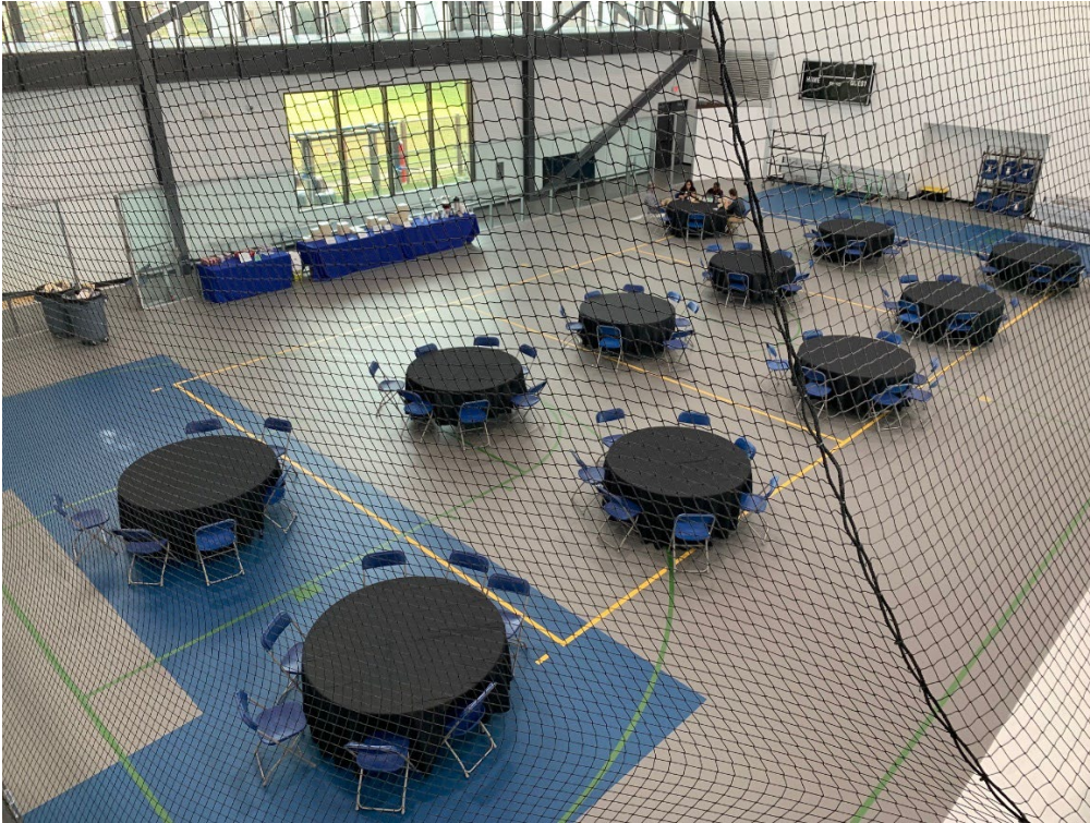
Figure 11: Hospitality area for UHCL Career Services Vendors