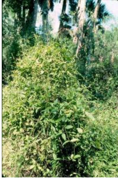
54. David milkberry or cahinca ( Chinococca alba )- This woody vine has been interpreted as the most common dominant species of the understory of climax sabal palm-Texas ebony floodplain forest. Cahinca is especially common-- sometimes the exclusive or nearly sole --dominant shrub of palm groves.