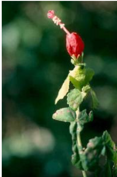
57. Drummond wax-mallow- Shoot apex with inflorescence. The telltale staminal column of the mallow family was displayed prominently by this proud member of the lower woody layer of the climax sabal palm-ebano floodplain forest. Audubon Sanctuary, Cameron County, Texas. October.