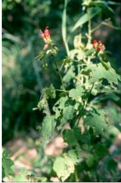
56. Shrubby or woody turk's cap, Drummond wax-mallow or Texas mallow ( Malvaviscus drummondii = M. arboreus var. drummondii )- One of the more common and, certainly, conspicuous understory shrubs in climax sabal palm-Texas ebony forests is this member of the mallow family (Malvaceae). Audubon Sanctuary, Cameron County, Texas. October.