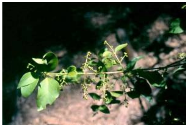
55. David milkberry or cahinca- Leader and shoot apex with some fruit of the dominant shrub (woody vine) of sabal palm groves. Audubon sanctuary, Cameron County, Texas. October.