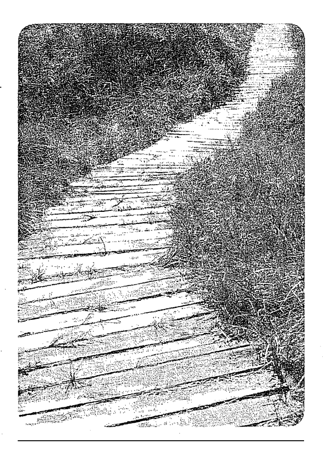
Thoughtful planning ensures that people with disabilities have convenient access to outdoor locations.

Beginning in 1996, many parks and wilderness areas began requiring a fee for a backcountry reservation, or even for a backcountry camping permit. In heavily regulated areas, such as the Grand Canyon or Rainier National Park, a major concern of noncommercial users is that most of the permits (up to 90%) have been allocated to commercial outfitters and guide services, leaving only a small proportion of permits for those with less money.