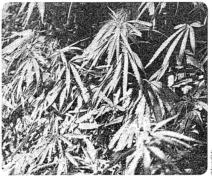
The cultivation and consumption of drugs such as marijuana on Forest Service lands is a growing problem.

Actual crimes and misbehavior of most kinds are increasing in outdoor recreation areas. These range