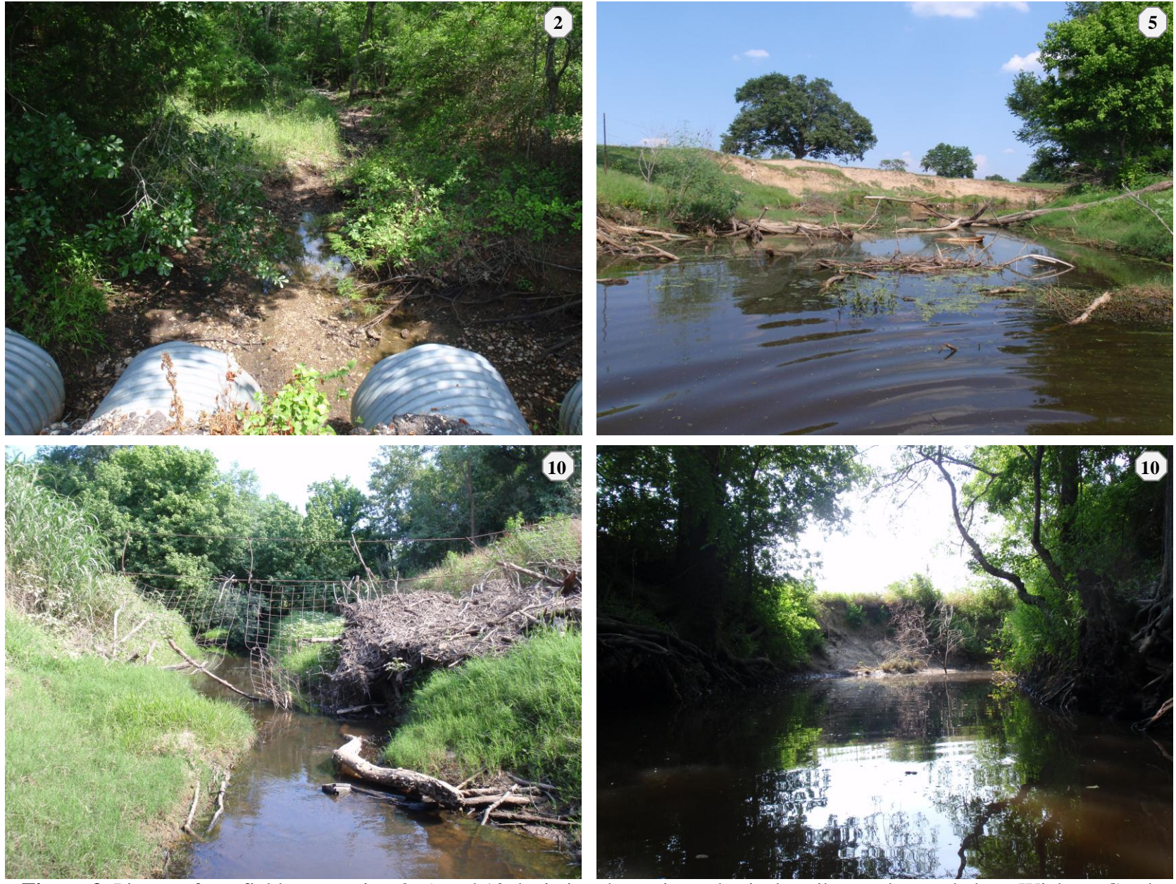
Figure 3. Pictures from field survey sites 2, 5, and 10 depicting the various physical attributes observed along Wickson Creek, Segment 1209E.