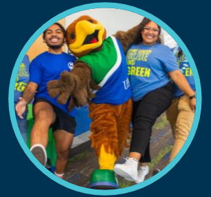
Programs & Workshops