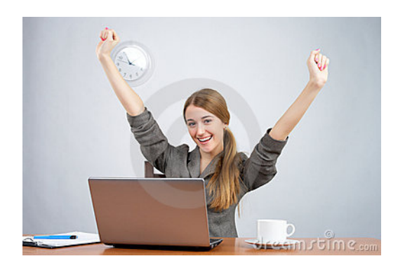
You, Too, Can Succeed Online!