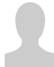
TBD Instructional Designer, HSH