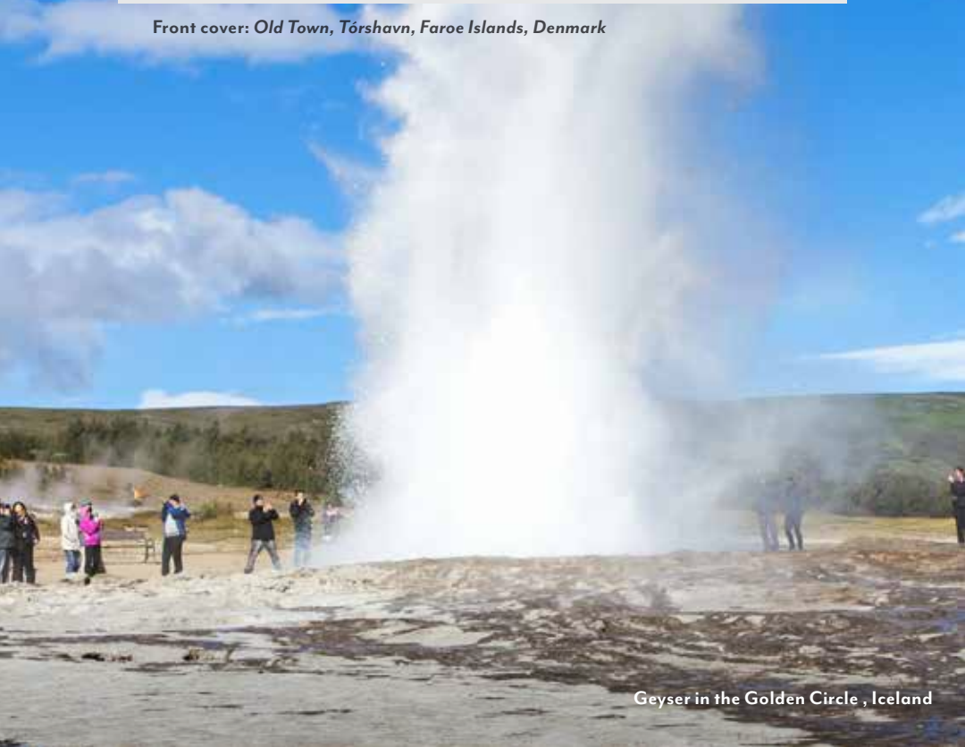
Geyser in the Golden Circle, Iceland

Front cover: Old Town, Tórshavn, Faroe Islands, Denmark