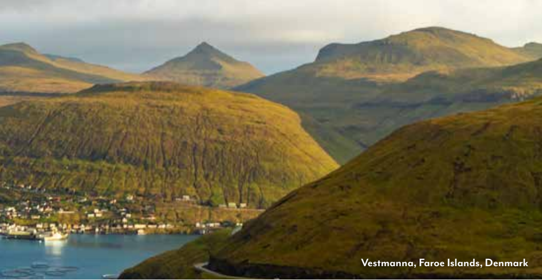
Vestmanna, Faroe Islands, Denmark