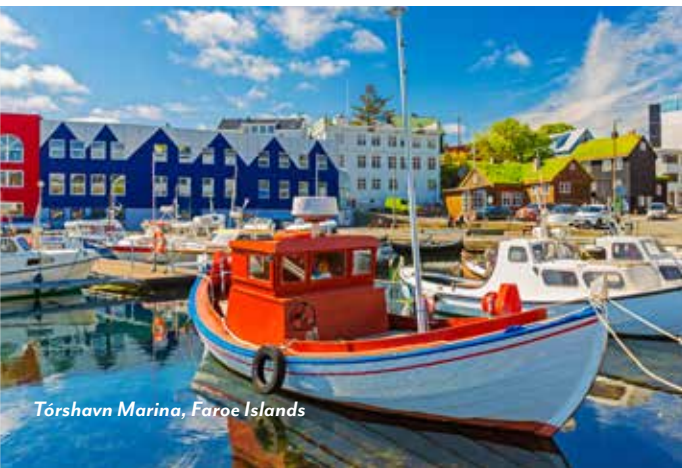
Tórshavn Marina, Faroe Islands

Disembark in Reykjavík and depart for your home city. (B)