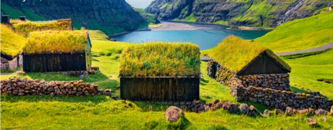
Dúvugarðar, Faroe Islands

Spend today cruising toward Iceland. Enjoy the amenities on the ship, perhaps indulging in a sauna or a dip in the hot tub. Spend some time on deck with a book or watching the horizon. Savor three delicious meals on board. (B,L,D)